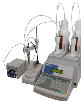
Figure 2: Autotitrator accessory for the SZ-100Z

The automation of isoelectric point measurement is achieved with the HORIBA Autotitrator accessory for the SZ-100Z shown in Figure 2. The Autotitrator automatically adds acid or base to adjust the pH of the sample, records pH, and loads the sample into the graphite electrode cell in the SZ-100Z. Zeta potential is then determined and the cycle is automatically repeated for the next pH in the series.