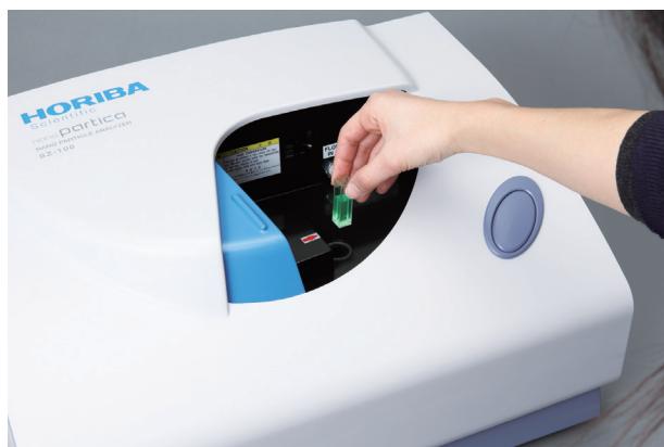
Figure 1: SZ-100Z Nanoparticle Analyzer

Zeta potential is the charge on a particle at the shear plane. This value of surface charge is useful for understanding and predicting interactions between particles in suspension. A large magnitude (either positive or negative), that is, over about 25 mV, zeta potential is generally considered an indication that the particle suspension will be electrostatically stabilized. Zeta potential can be measured with the HORIBA SZ-100Z shown in Figure 1.