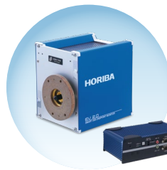
EV 2.0 Series