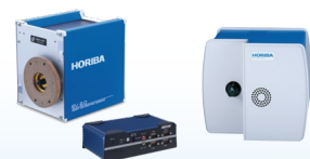
EV 2.0 Series

Combination of high throughput and high resolution optical emission spectrometer with advanced endpoint algorithm