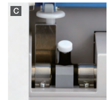
Set the cell to the equipment