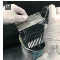
If the component is bigger than the beaker, pour the solvent on the component to extract oil on uneven surfaces