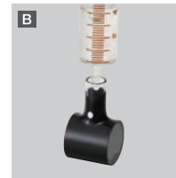
Apply the solvent into cell