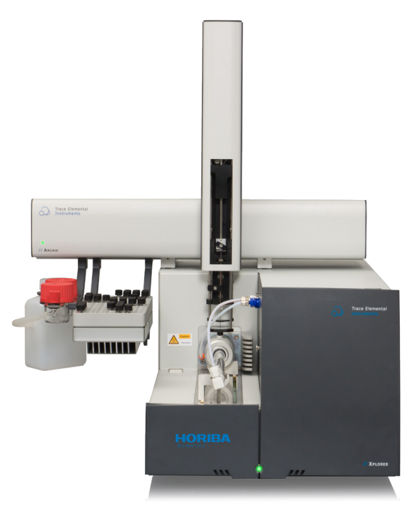
XPLORER with ARCHIE*