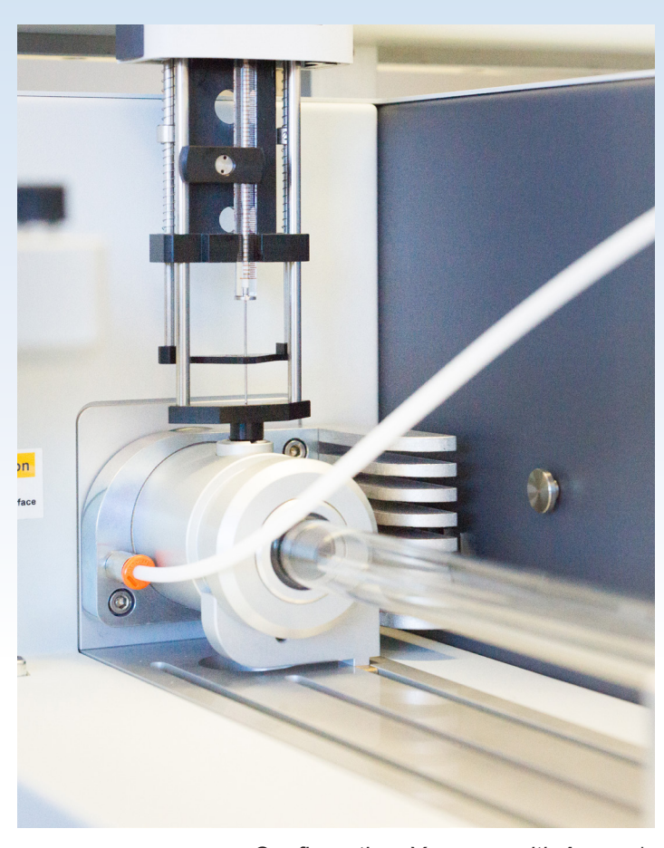
Configuration: XPLORER with ARCHIE*

For the introduction of gas and LPG samples there is the GLS auto sampler. It can also be run as a stand-alone, method driven, gas sampler, using a touch screen as the user interface. The introduction of solid samples can be executed by the stackable NEWTON auto sampler, which simply utilizes gravity, for high sample throughput and low cost per analysis. Various sample cups are available for all types of applications.