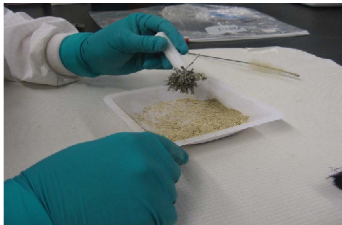
Figure 2: Removal of metallic debris using a magnet.

This activity often results in the mesh being reduced to small metal pieces. Both washcoat and metal pieces are typically collected in large weigh boats positioned beneath the samples. Metallic fragments are then removed from the recovered materials. Larger pieces may be separated individually, while a magnet may be used for removal of small metal debris (Figure 2).