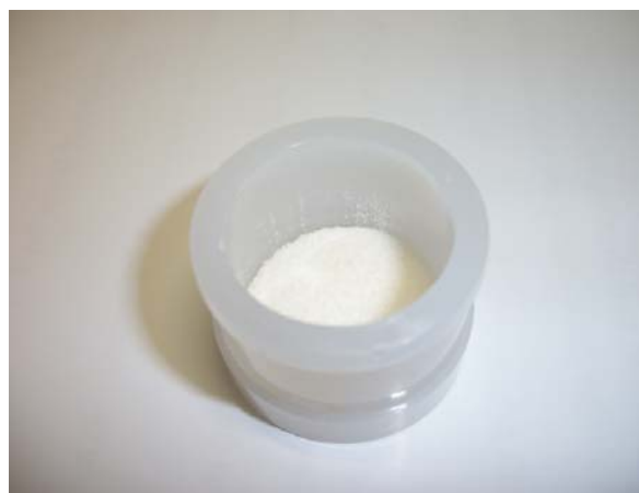
Figure 3: Recovered washcoat in 31 mm diameter sample Cell; Typical test specimen depth – 2-3 mm

Once sample collection and cleaning is accomplished, the ability to evaluate a test specimen for precious metal content using X-ray fluorescence (XRF) methodologies is relatively easy. Because powder matrices may be readily analyzed, there is no need for further sample treatment. Testing is also non-destructive, which preserves the quantity and quality of the collected sample material and eases sample retain and chain of custody procedures.