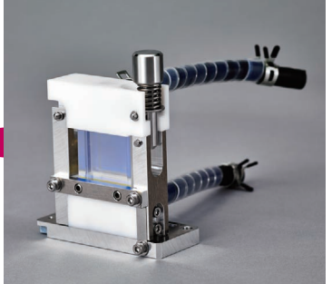
The whole flow cell unit can be removed and replaced easily.