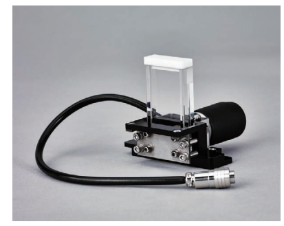
The Fraction cell optional accessory enables measurement of very limited sample amounts and collecting them after the measurement. The stir bar inside of the cell prevents the particle segregation and sedimentation.