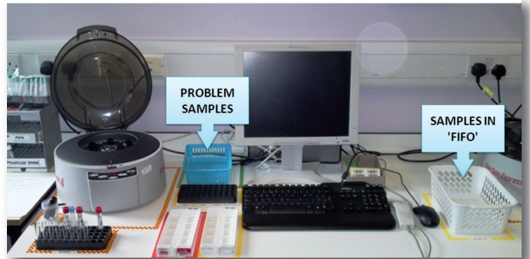
Fig 3 Lean Pre-Analytical Work Cell

In our laboratories, Lean is being applied to all work processes across the pre-analytical, analytical and post-analytical phases to achieve a total Lean laboratory solution. For example, the same Lean work cell philosophy has been applied to the pre-analytical process (Fig 3). Here, a single operator undertakes all pre-analytical functions in a single process from de-bagging, sample & request checking, bar-coding, data entry, sample racking and centrifugation. The layout of the work cell is standardised so that each work cell is identical. Samples are processed one at a time achieving 'single piece flow' on a 'first in first out' basis. Problem samples are taken out of the process so as not to interrupt the work flow. The entire process is designed to optimise throughput and eliminate opportunity for error.