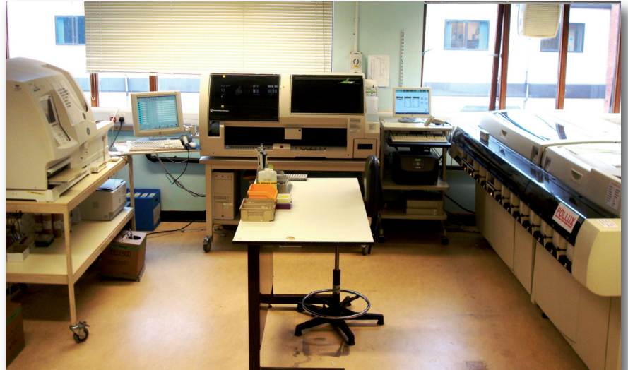
Fig1 U-Shaped Lean Work Cell

Allied to the development of a Blood Science analytical work cell is the requirement to simultaneously address layout and location issues in specimen reception and blood transfusion laboratories. Both functions should, again, ideally be co-located or within close proximity to the core Blood Science laboratory.