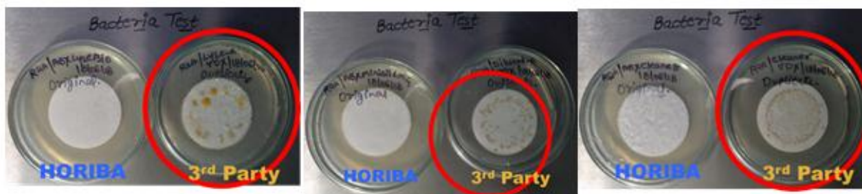
Fig-1: Bacteria growth analysis on third- party and HORIBA original reagent in R2A culture medium

Fungal Test: third- party diluent, third- party Lysing reagents, third- party Cleaner are streaked on SDA (Sabouraud Dextrose Agar) Medium for fungal culture for 5 days in Laminar air flow. We have streaked also ABX Cleaner, ABX Lysebio and ABX Minidil LMG on SDA (Sabouraud Dextrose Agar)