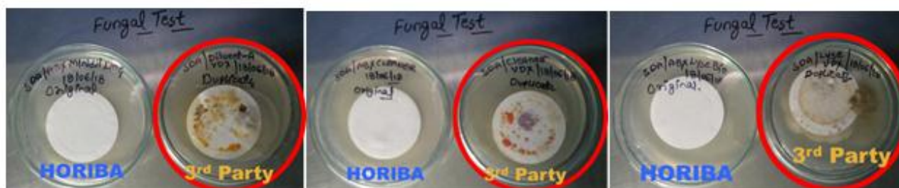
Fig-2: Fungal growth analysis on third- party and HORIBA original reagent in SDA culture medium