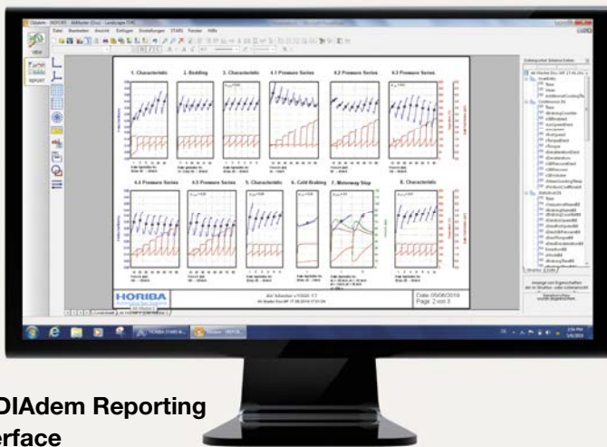
NI-DIAdem Reporting Interface