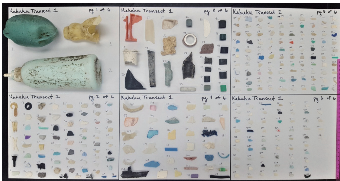
Figure 3 Photo of Hawaiian marine debris items, Windward Oahu beach. Kahuku Transect 1 [7]

Raman is a relatively new technology for MP analysis, gaining recognition in recent years. It is important to evaluate a new technology with respect to existing technologies. For MP analysis, the two methods used are mainly pyrolysis gas chromatography-mass spectrometer (pyro-GC-MS) and Fourier transform infrared (FT-IR) spectroscopy. MP samples from Hawaii were analyzed by three technologies for comparison, each at a different laboratory using a different technology. The results proved not the superiority of a single technology but the impor-