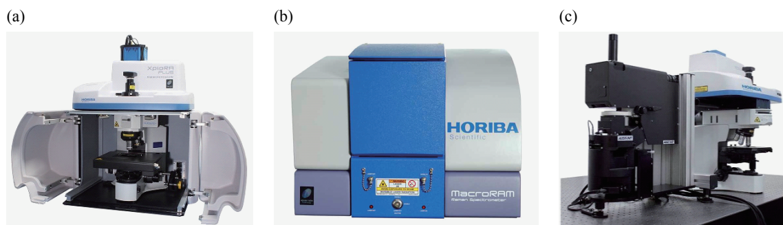
Figure 1 HORIBA Raman instruments. (a) XploRA PLUS, (b) MacroRAM and (c) XploRA Nano

land, including in landfill sites, coastlines, in Arctic sea ice, and on the sea surface and floor. [1] During these long years, plastics fragment into small particulates, forming microplastics (MPs) and nanoplastics (NPs). They are not only hazardous for wildlife, but also pose health risks for humans [2] through air pollution (e.g. nanotoxicity due to inhaling NPs), water (e.g. MPs in drinking water) and food sources.