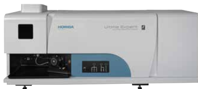
Figure 1: Ultima Expert

This application note will describe the analysis of brines using the Ultima Expert ICP-OES, that is ideal for brine analysis as it does not require dilution of the samples and it allows the analysis of many elements with low detection limits.