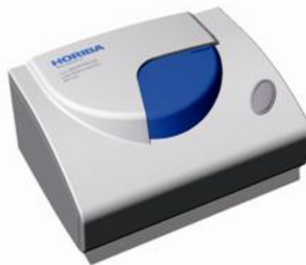
Figure 1: SZ-100 Nanoparticle Analyzer.

The zeta potential is related to the surface charge of suspended particles. Therefore, its measurement using the HORIBA SZ-100 Nanoparticle Analyzer (Figure 1) can be used to monitor the effect of coagulant addition.