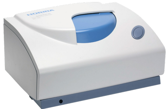
Figure 1: SZ-100 Nanoparticle Analyzer.

Aggregation is enhanced through the mechanism of charge neutralization; additives are used to reduce the magnitude of the particle surface charge to zero, ideally at minimal cost. This minimal cost requirement implies that the optimal amount of additive needed be determined. One widely used class of such additives are termed coagulants; typically inorganic salts with polyvalent ions. Unfortunately, addition of too much coagulant (overdosing) causes charge