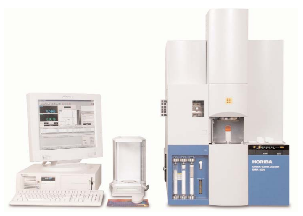
Figure 1: EMIA 820V

The high frequency or induction furnace is equipped with a plate current control function. This allows users to easily optimize the temperature according to the samples. Some customized temperature curves can be created in order to observe various phenomena such as surface contamination and different phases or forms of carbon and sulfur.