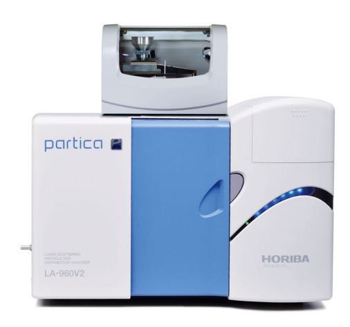
Figure 1. The Partica LA-960V2 laser scattering particle size distribution analyzer.