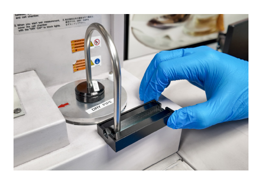
Figure 2. The sniffer tray sliding under the vacuum nozzle attached to the PowderJet.