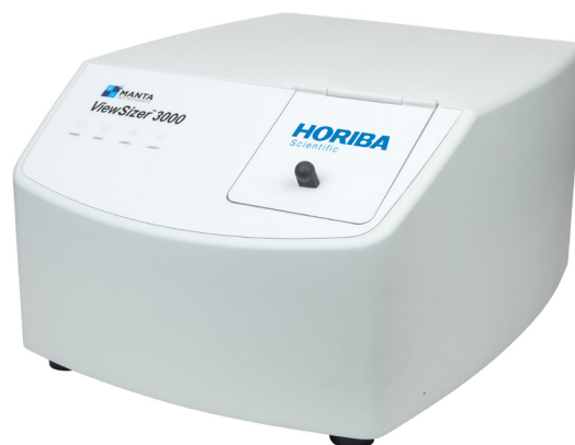
Figure 1: Image of the ViewSizer™ 3000

The ViewSizer™ 3000 features three simultaneously operating lasers with independently adjustable power and a color camera. In this way, the data from each laser is collected simultaneously as a separate video (color) stream. In addition, the system is designed to ensure only diffusive motion can be captured, eliminating the need for artifact inducing drift correction schemes. Finally, with vigorous stirring between short videos, the suspension is randomly sampled to ensure a representative result.