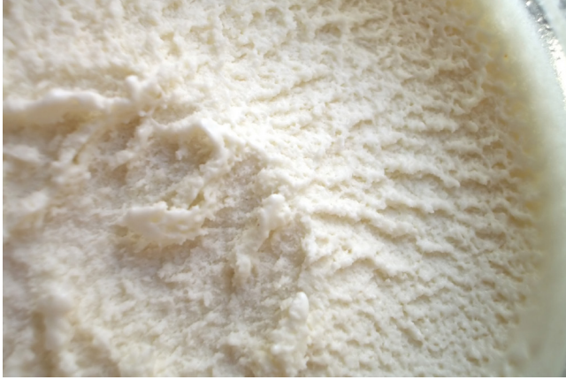
Figure 5: Ice cream is a tempting food emulsion often prepared with ingredients such as the ones under study.

For these industrial materials, the expectation of uniform spheres and extremely narrow size distributions is inappropriate. In the case at hand (emulsions) the particles are expected to be spherical. Thus, while the shape may not cause the results obtained by the two techniques to differ, the breadth of the size distribution will. Even so, both techniques show the same trends.