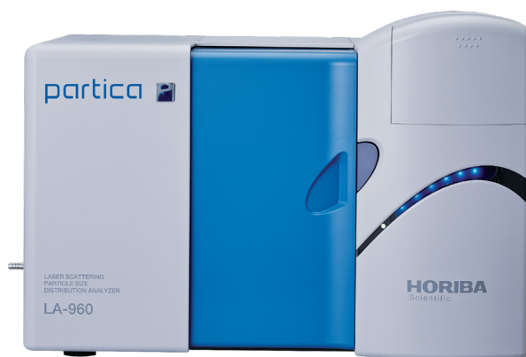
Figure 2: LA-960 Particle Size Analyzer.

Dynamic light scattering (DLS) is the technique of choice for analyzing the size of submicron particles including nanoparticles (2). DLS can be used to characterize particles with sizes ranging from less than a nanometer to several microns. As in laser diffraction, the measurement is fast and repeatable, but DLS can only be used with liquid suspensions. On the other hand, the volume of liquid required can be as little as 10 microliters. In addition, particle charge, that is, zeta potential can be determined with an appropriately modified DLS instrument.