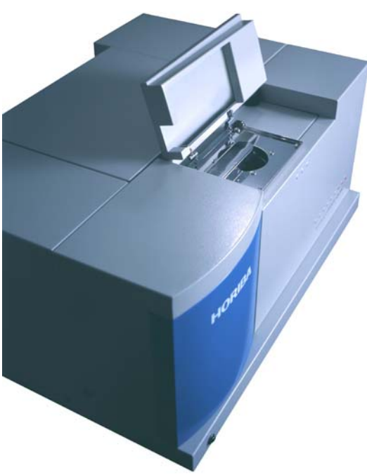
Fig. 2 Horiba LA-930

Particle size of the cocoa powder can be measured after the chocolate liquor has been rendered from the bean at about 100 microns, after the press cake is ground into cocoa powder, and after conching is done, about 18 microns. In addition, The LA-Series instruments can measure the size of the sugar to be added for the conching process. This is important because it is the sugar crystals that help break down the cocoa particles in the conching process.