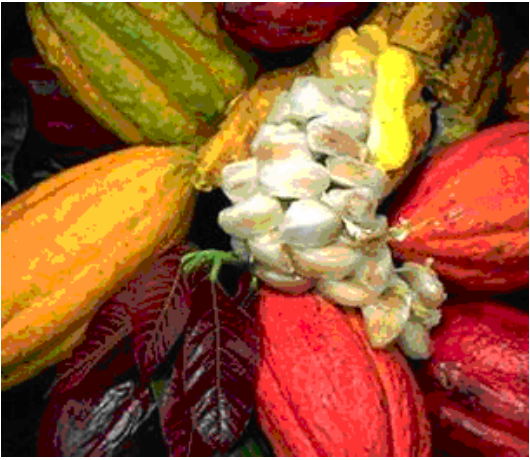
Fig. 1 Cacao tree fruit and seeds

Cocoa trees resemble apple trees except the fruit grows directly on the trunk instead of on the ends of the branches. Each tree is capable of producing 20-30 pods per year. Each pod contains 20-40 seeds. It takes a whole year's production from one tree to yield 450 grams of chocolate.