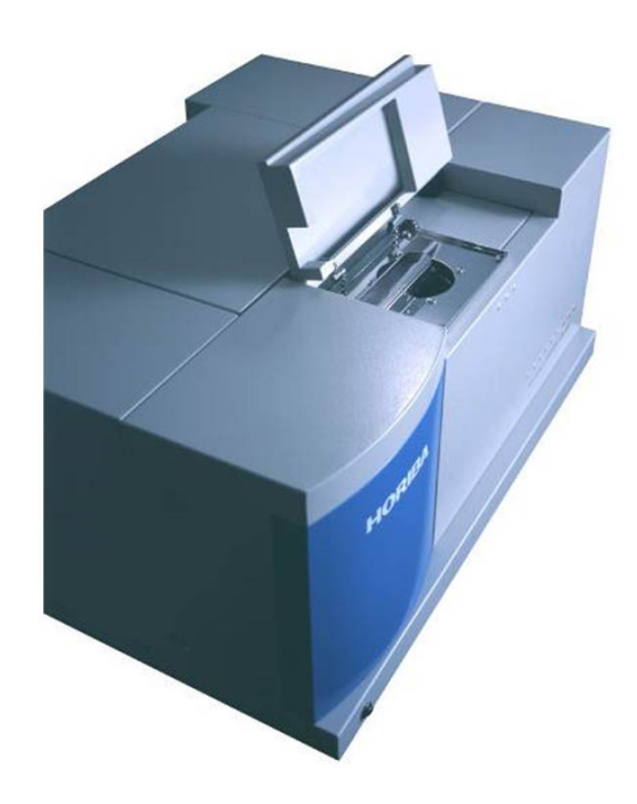
LA-930 Particle Size Analyzer

HORIBA's LA-910 and LA-930 particle size analyzers have proven particularly popular for this application with numerous installations in the industry. The stability, broad size range, and ease-of-use make it ideally suited to the quality control in the manufacturing process.