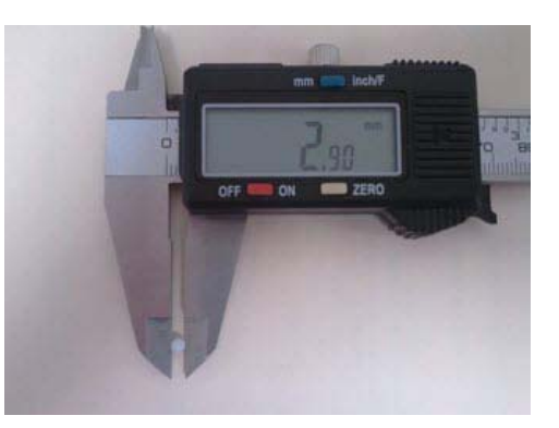
Figure 1: Size of a plastic bead measured by caliper

Instrument: LA-960 Laser Diffraction Particle Size Analyzer Sample: Monodisperse 2.9 mm Plastic Beads Dispersing medium: DI water