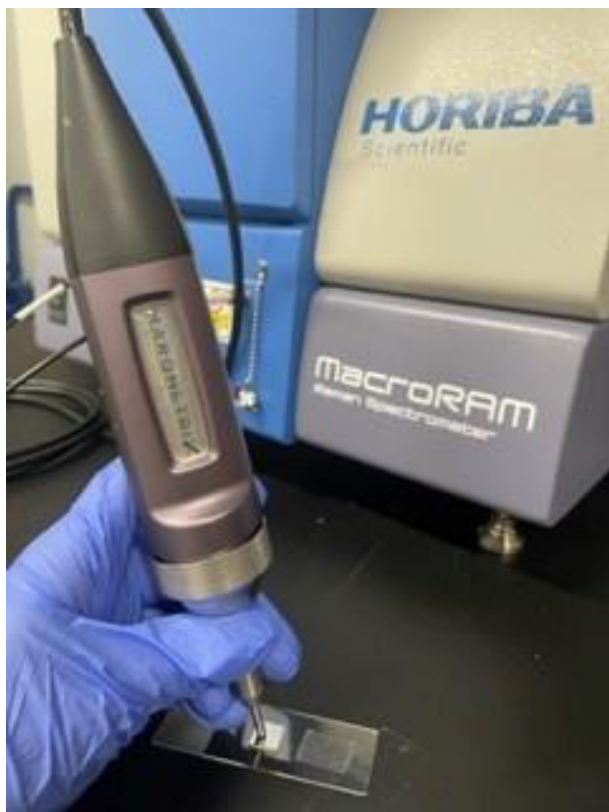
Figure 2: Sample measurement configuration; touch probe connected to the MacroRAM for easy and fast data collection.

The ratio of the D to G bands is commonly used to characterize carbon for industrial applications. But because of the double resonance in these materials, the spectra are highly dependent on the excitation wavelength 1 . In addition, the bands' central Raman shift, band width, and relative intensity (peak height or integrated intensity) vary with the ordering of the carbon lattice. The properties that affect