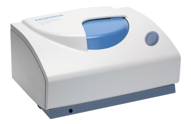
Figure 1: SZ-100 Nanoparticle Analyzer.

The zeta potential is related to the surface charge of suspended particles. Therefore, its measurement using the HORIBA SZ-100 Nanoparticle Analyzer (Figure 1) can be used to monitor the effect of coagulant addition.